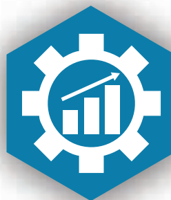
Executive Search & Recruiting