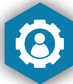
RPO and PPOS