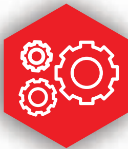
Flexible Contingent "Flex-Force"

We serve organizations with workforce requirements through our Flex Force, Performance-to-Hire, and Flex Hire Direct programs that rapidly fill high-demand roles with floor-ready associates. Our skilled talent acquisition and recruiting services fill specialized and leadership positions. At TOTAL, our advanced solutions include comprehensive strategies for acquisition, on-boarding, engagement and retention.