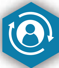
Direct Hire/Skilled Talent