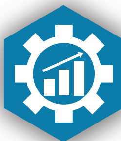
Executive Search & Recruiting